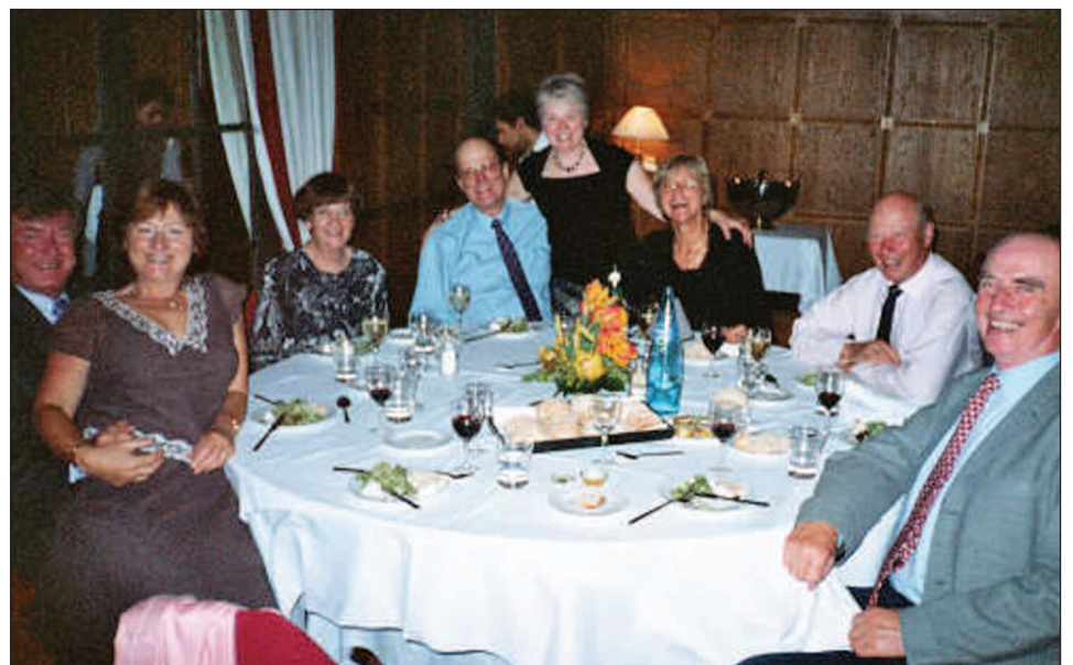
Computer says 'smile': IBM members enjoy the gala dinner during a recent trip to Deauville, France