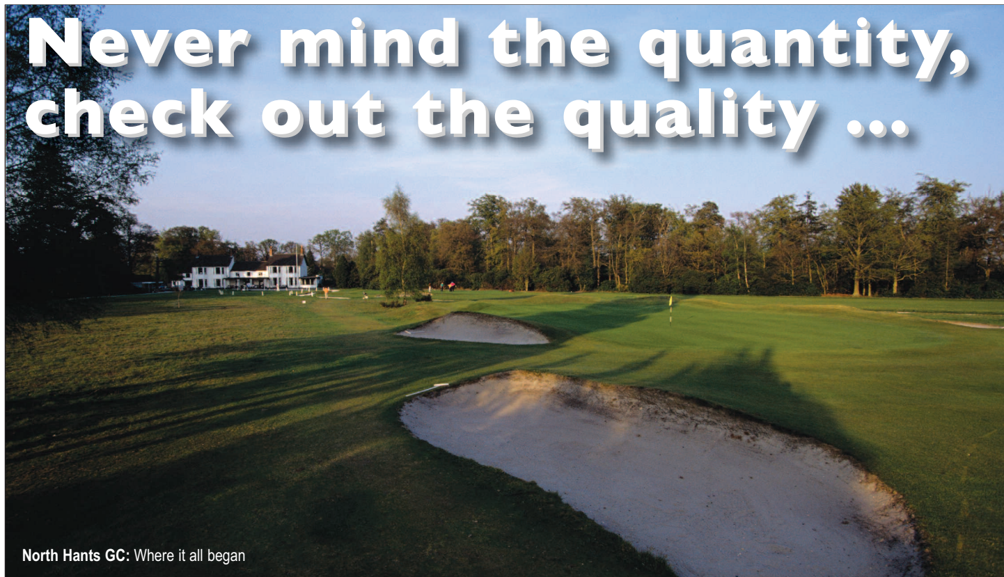
North Hants GC: Where it all began

T hat was me standing behind you in the pro shop the other day when you complained you couldn't get on the course because a society was out there.